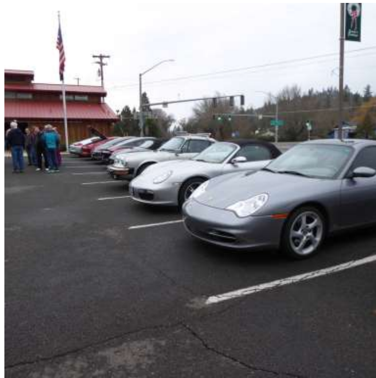
A FEW OF THE CARS READY TO "TAKE OFF" TO THE GALLERY OF RARE CARS

On the 14th of December at 2019 at 1:30 P.M. excited members of the Southern Chapter of the PCA and their 14 cars and one pickup truck gathered in the small town of